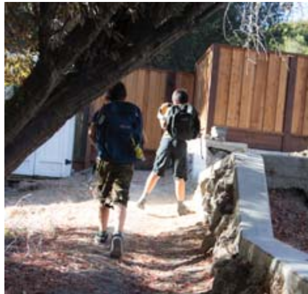
The gate at 53 Rheem.